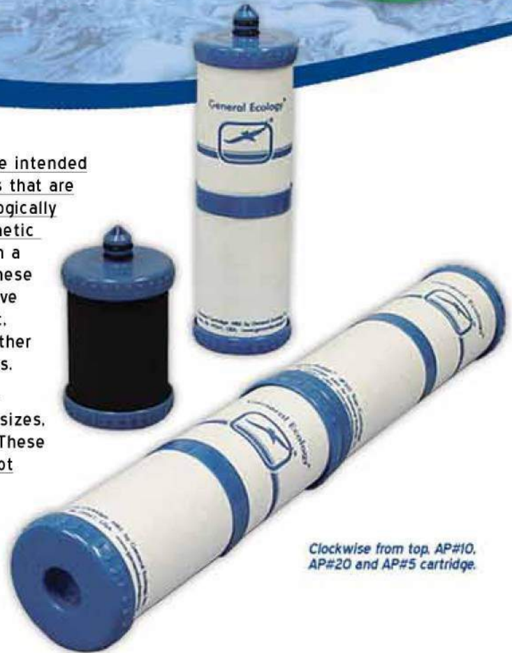
Clockwise from top, AP#10, AP#20 and AP#5 cartridge.

Aqua-Polish cartridges are available in three standard sizes, AP#5 , AP#10 and AP#20 . These products are intended to not remove minerals or salts.